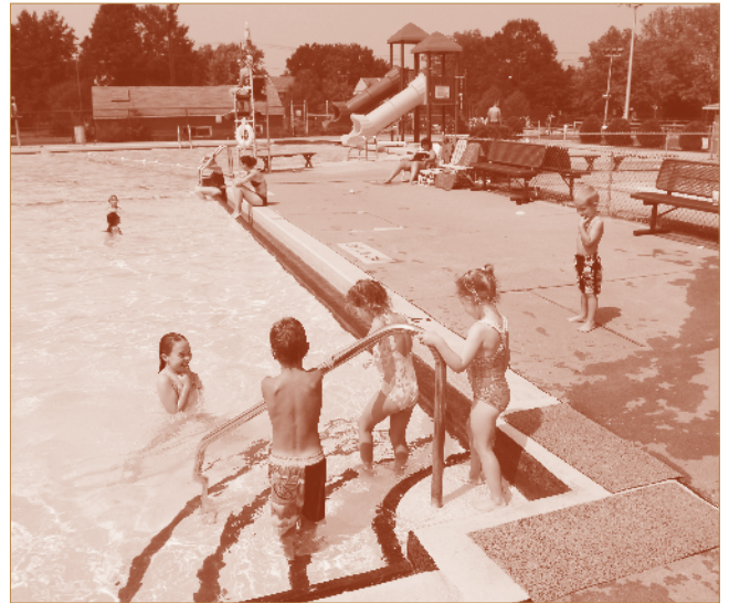
Souderton Pool, 2007

The conceptual plan for the upper pool calls for a complete renovation, with bulkheads that separate the pool into different sections. A zero-entry area will have a gradual slope that makes the pool handicapped accessible and creates a fun place for young children to play and swim. Other sections