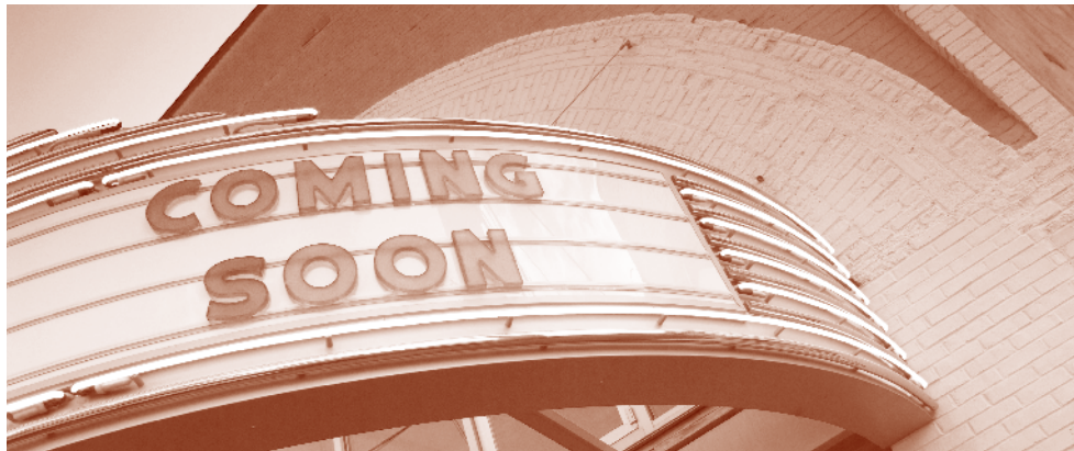
The Broad Theater is expected to be transformed into a viable business by the end of 2009, with a café and a fine dining restaurant in the building next door.

The Broad Theater expects live shows to include musical acts, comedy routines, and cooking expositions. The versatile space is also expected to house contests and cocktail parties. The auditorium will be wired for corporate networking events, presentations, and seminars.